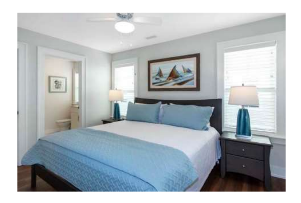
Room 5 King Suite (Ground Level)

King Bed/Double Occupancy, Private Bath $500 per person