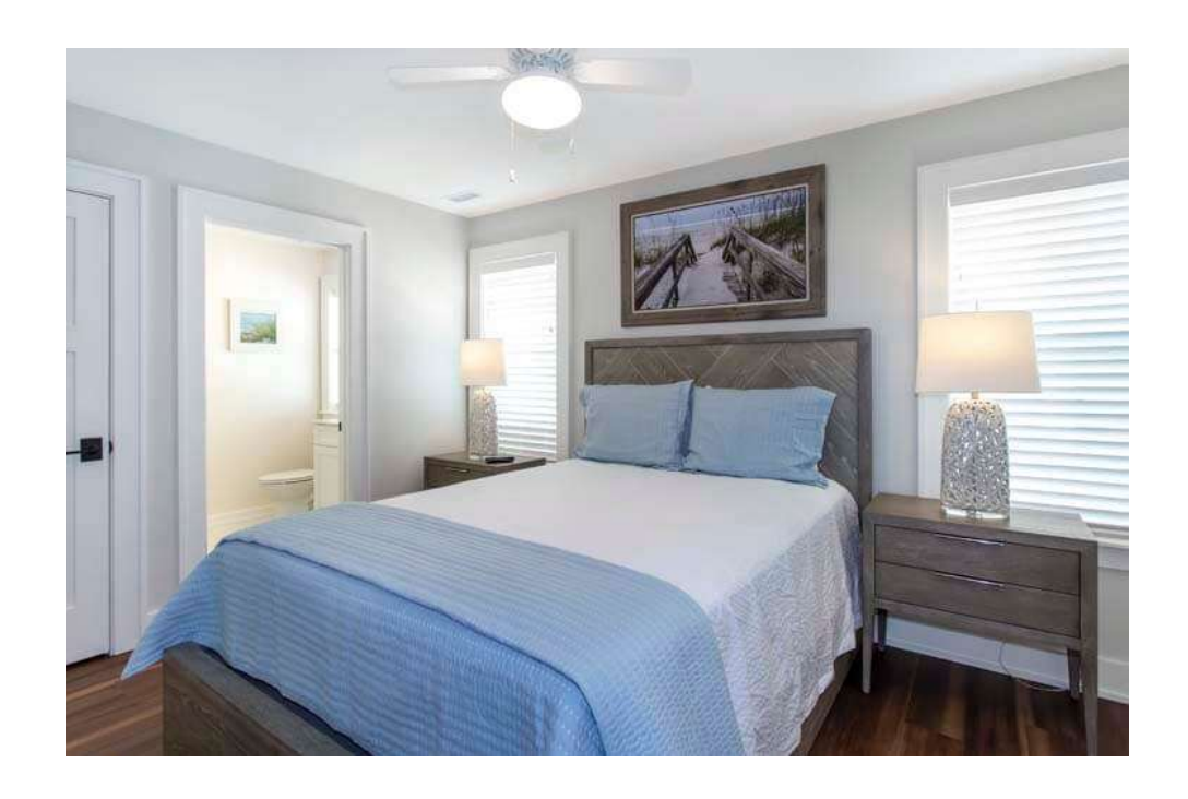
Room 11 Queen Suite (Mid Floor)

Queen Bed/Double Occupancy, Private Bath $480 per person