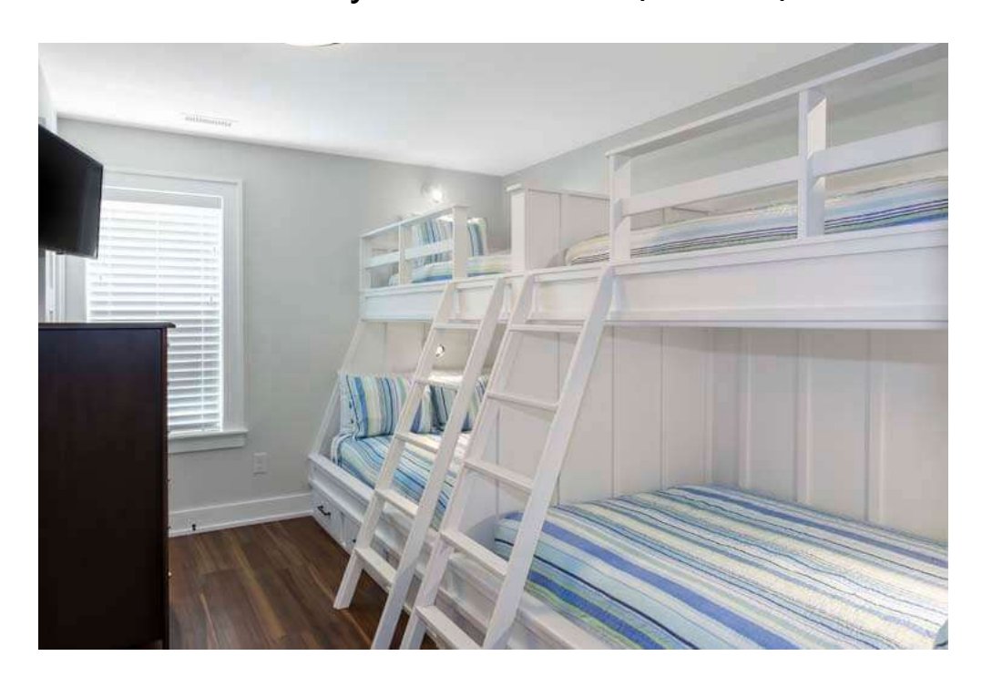
Room 17 Pyramid Bunk Side 2 (Mid Floor)

*Bunk Room, 4 Person Occupancy, Shared Large Bath and ½ Bath with Adjoining Room *Single Reservations ONLY