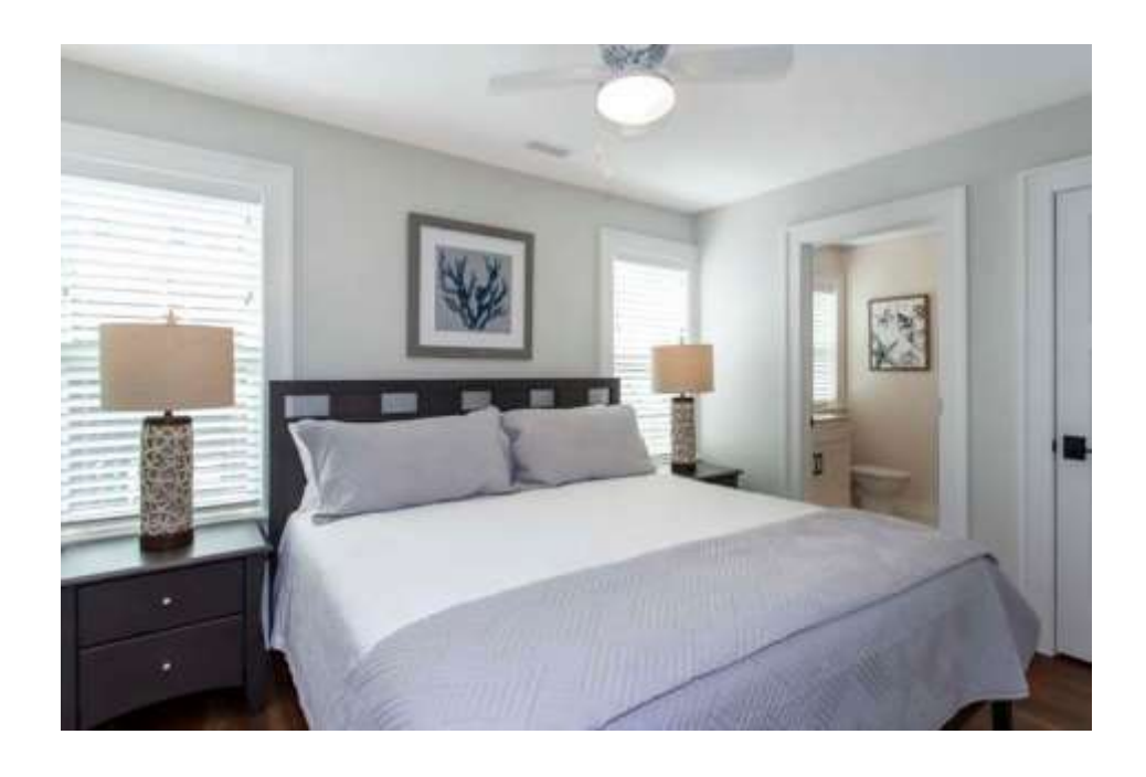
Room 4 King Suite (Ground Level)

King Bed/Double Occupancy, Private Bath $500 per person