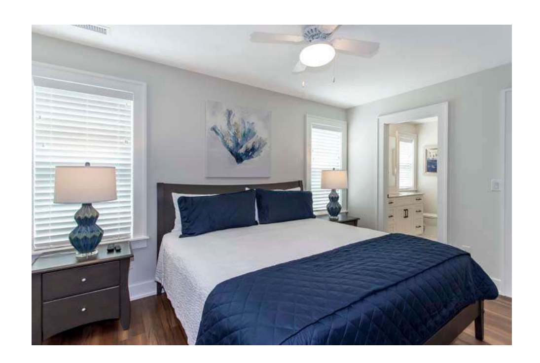
Room 14 King Suite (Mid Floor)

King Bed/Double Occupancy, Private Bath $500 per person