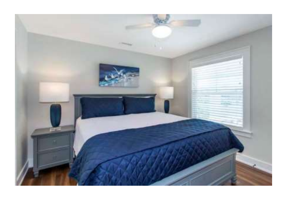
Room 2 King Suite (Ground Floor)

King Bed/Double Occupancy, Dresser, Private Bath $500 per person