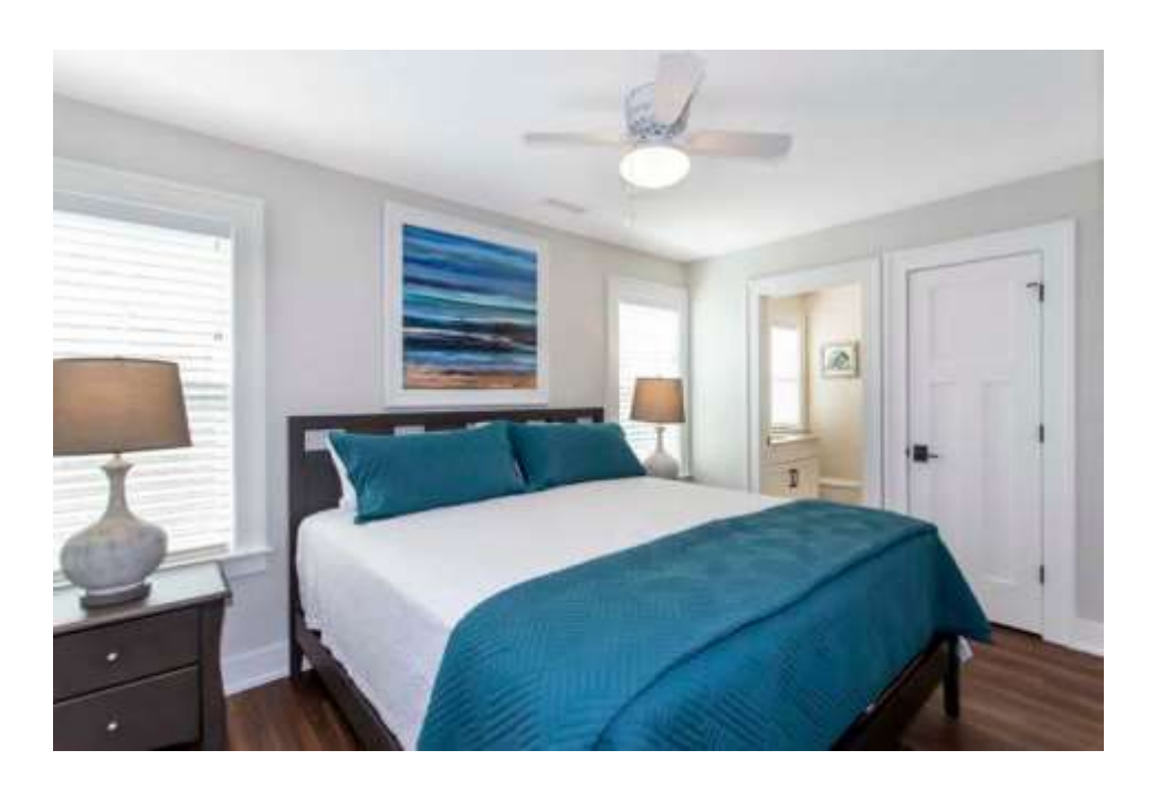
Room 6 King Suite (Ground Level)

King Bed/Double Occupancy, Private Bath $500 per person