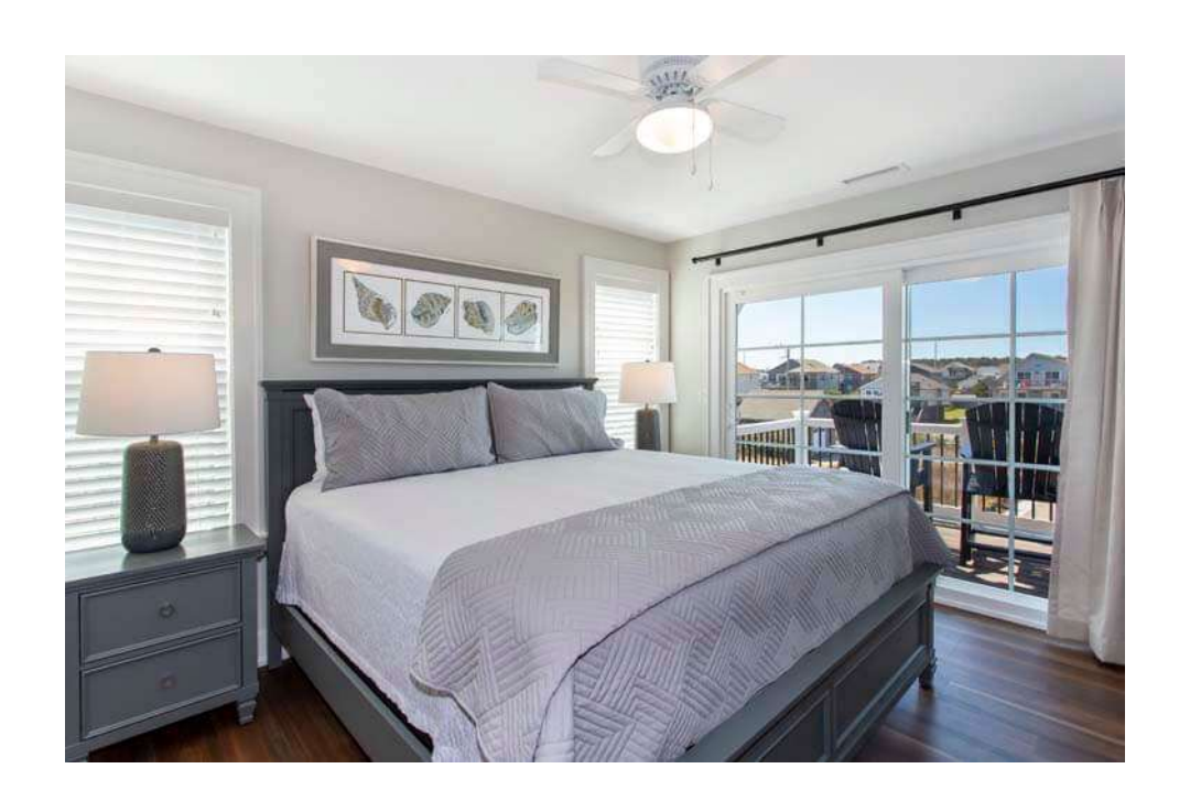
Room 10 King Balcony Suite (Mid Floor)

King Bed/Double Occupancy, Dresser, Large Closet, House Front Balcony & Private Bath $545 per person