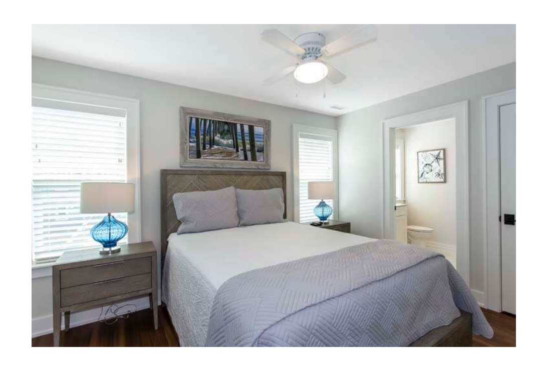
Room 12 Queen Suite (Mid Floor)

Queen Bed/Double Occupancy, Private Bath $480 per person