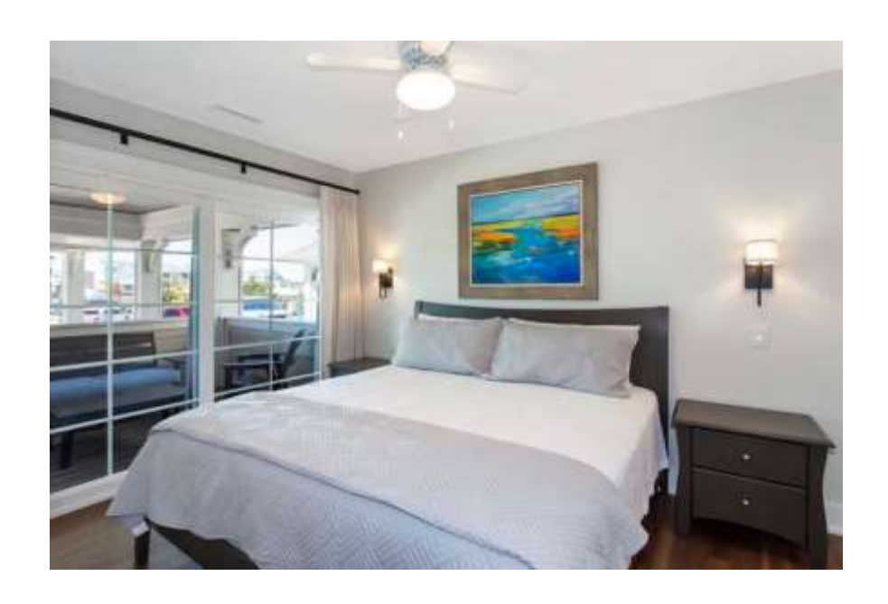
Room 1 King Balcony Suite (Ground Floor)

King Bed/Double Occupancy, House Front Balcony, Private Bath $545per person